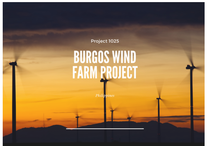
Project 1025: Wind Power in the Philippines