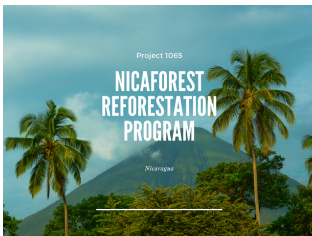
Project 1065: Reforestation in Nicaragua