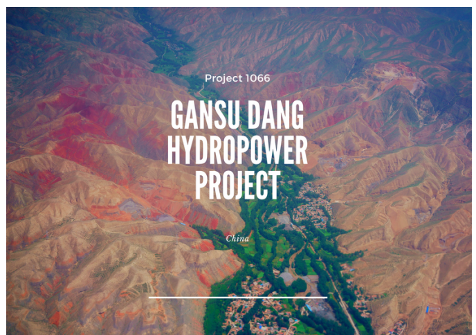
Project 1066: Hydroelectric Power in China